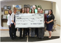
▶ PREGNANCY SERVICES OF DELTA COUNTY