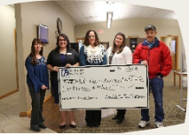
▶ DELTA COUNTY CANCER ALLIANCE