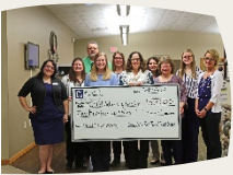
▶ CHILD ADVOCACY AGENCY